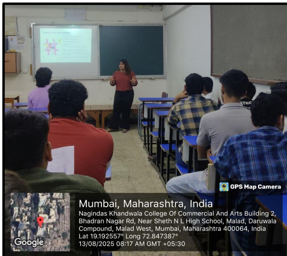
Our speaker explaining about how content is the new currency